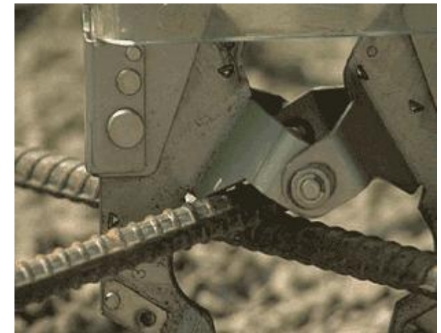
WDS Auto Bar Fixer ABF0010

Innovative People Innovative Company Innovative Ideas