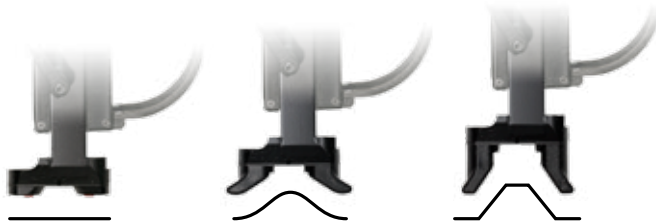
Individual profile guides fit flat profile of cladding sheets, corrugated-profile metal roofing sheets, and ribbed/square profile of square-ridge metal roofing sheets.